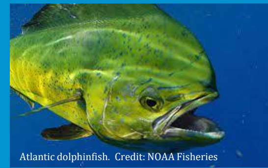
Atlantic dolphinfish.