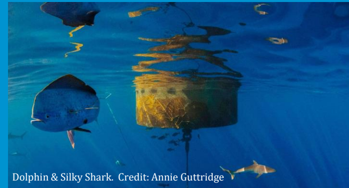
Dolphin & Silky Shark.