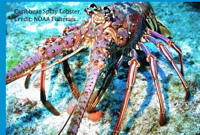
Caribbean Spiny Lobster.