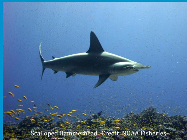
Scalloped Hammerhead.