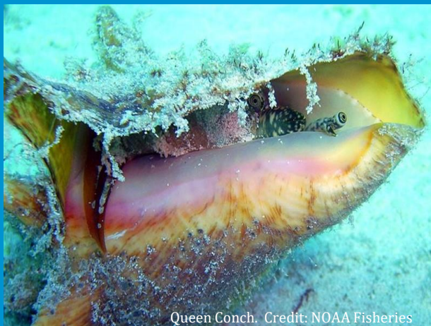
Queen Conch.